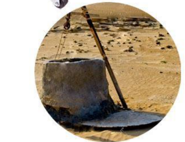
desert underground water